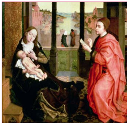
Saint Luke painting the Virgin Mary

All are welcome to celebrate the work and dedication of all health professionals.