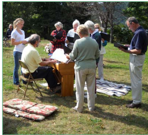
Choir rehearsing last year

We will all gather at 10AM for Holy Eucharist, hang out for fellowship afterwards and share barbecue and potluck dishes together. This wonderful way to celebrate the end of summer will also allow those of you seasonal folks who are still